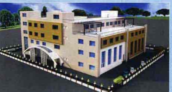
Bawal Project for investment casting to be commissioned shortly

fully committed and sincere to whatever you do in life, do it with full involvement, and you can convert your effort into a sure success."